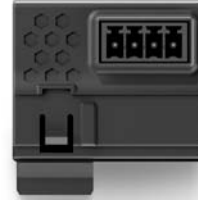
RS485 interface - Black