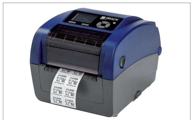
Step 3: Print