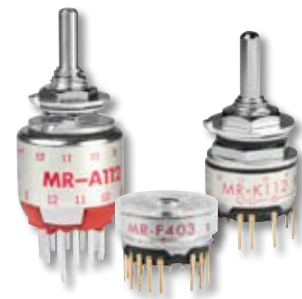
Changes for Miniature Process Sealed Rotaries

I. There will be production changes for MRA, MRF and MRK switches, the miniature process sealed rotaries. The lot number on the switch will be modified to have a dot mark above the first digit. The location of production will change, and the box in which the switches are packaged for shipping will read "CHINA FACTORY" instead of "JAPAN FACTORY." These modifications will apply to standard and custom products.