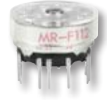
Changes for MRF Rotaries

2. The place of manufacture will change for MRF switches, the half-inch process sealed rotaries, and “JAPAN” will no longer appear on the switch case. In addition, the logo for MRF Rotaries will be updated. This modification will include all standard and custom devices.