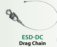
ESD-DC Drag Chain

CONVERT STANDARD WIRE SHELVING INTO CONDUCTIVE SHELVING WITH THESE ACCESSORIES THAT ARE INCLUDED WITH THESE PACKAGES