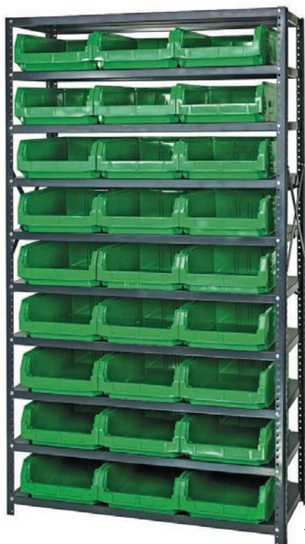
MSU-531 10 shelves and 27 QMS531 19-3/4"L x 12-3/8"W x 5-7/8"H bins