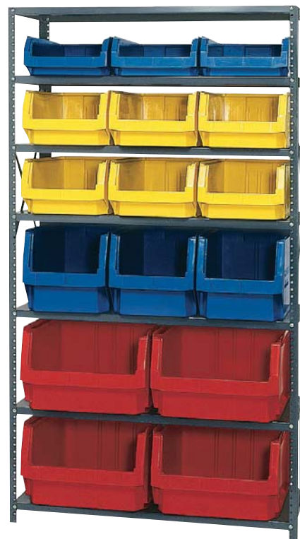
MSU-16-MIX 7 shelves and 4 QMS543 19-3/4"L x 18-3/8"W x 11-7/8"H bins, 3 QMS533 19-3/4"L x 12-3/8"W x 11-7/8"H bins, 6 QMS532 19-3/4"L x 12-3/8"W x 7-7/8"H bins, 3 QMS531 19-3/4"L x 12-3/8"W x 5-7/8"H bins