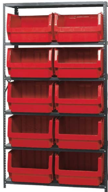
MSU-543 6 shelves and 10 QMS543 19-3/4"L x 18-3/8"W x 11-7/8"H bins