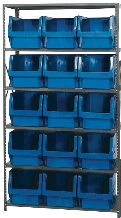
MSU-533 6 shelves and 15 QMS533 19-3/4"L x 12-3/8"W x 11-7/8"H bins