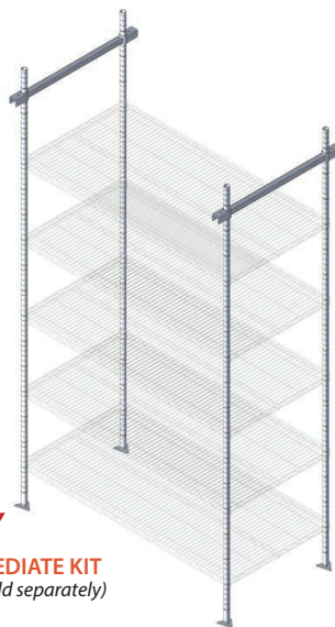
NEW INTERMEDIATE KIT (Shelves sold separately)