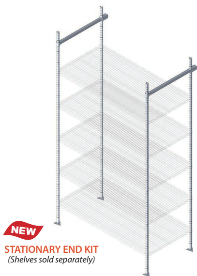
NEW STATIONARY END KIT (Shelves sold separately)