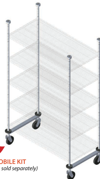
NEW MOBILE KIT (Shelves sold separately)