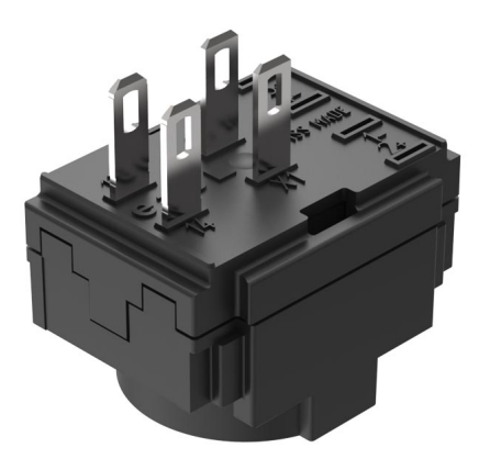
Attention: The preview is based on a sample product. This can differ from your current configuration.

61-8440.12 - Switching element for pushbutton and keylock- and selector switch 2 positions