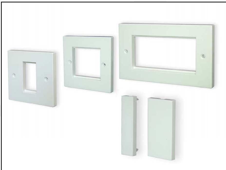
'Euro Style' Faceplates KPH1wh, KPJ2wh, KPL4wh, KPR0.5wh, KPR1wh

The TUK 'Euro Style' 25x50 range of faceplates are manufactured in flame retardant, UV stable ABS in high gloss finish. Their standardised dimensions make them compatible with the vast majority of voice and data modules used on the UK market and they are complemented by our range of adaptors for keystones. The faceplates are supplied with fixing screws for installation.