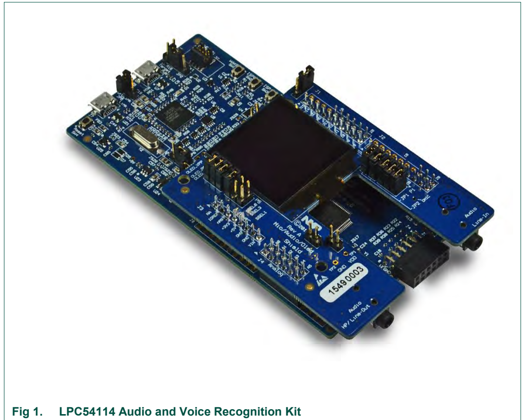
Fig 1. LPC54114 Audio and Voice Recognition Kit

The LPC54114 audio and voice recognition kit (“The Kit”) combines the LPC54114 MCU with an OLED display, digital microphone and audio CODEC in a two board set, complemented by a software framework optimized for always-on sensing applications. The hardware consists of an LPCXpresso54114 board and Shield Board (Mic/Audio/OLED or MAO Shield), developed by NXP for flexibility and ease of use. The Kit can be used with a wide range of development tools, including the LPCXpresso IDE, Keil uVision, and IAR EWARM of NXP.