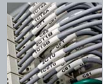
Wire & Cable Labels and more!