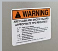
Arc Flash Labeling