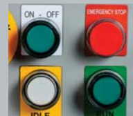
Raised Panel Labeling