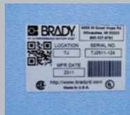
Product Identification Labels