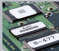
Circuit Board Labeling