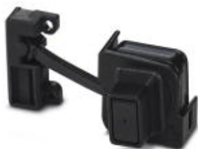
Protective covers, degree of protection: IP65/67

Please be informed that the data shown in this PDF Document is generated from our Online Catalog. Please find the complete data in the user's documentation. Our General Terms of Use for Downloads are valid ( http://phoenixcontact.com/download )