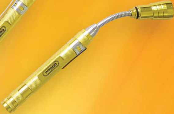
91383 Telescoping Magnetic Pick-Up