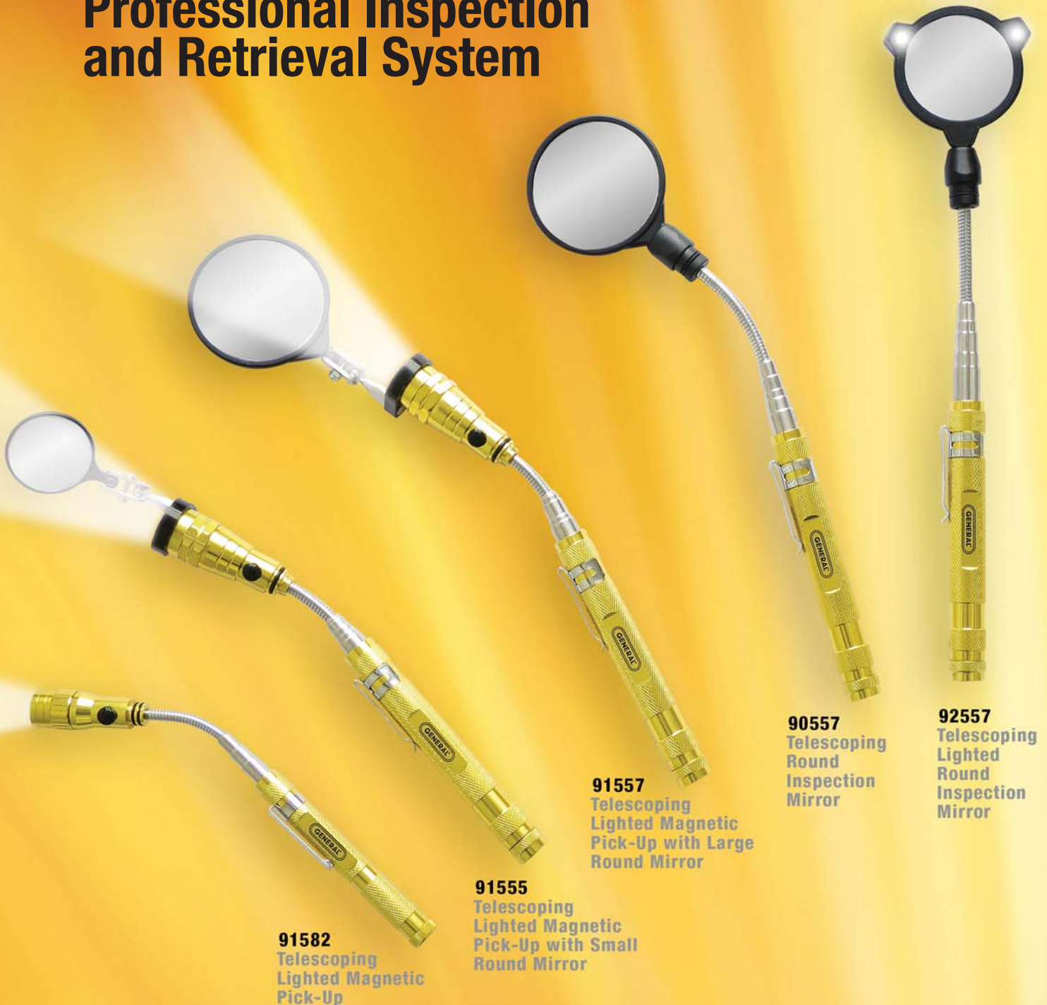
91582 Telescoping Lighted Magnetic Pick-Up