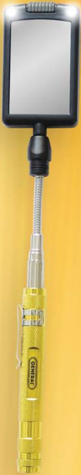
92560 Telescoping Lighted Rectangular Inspection Mirror