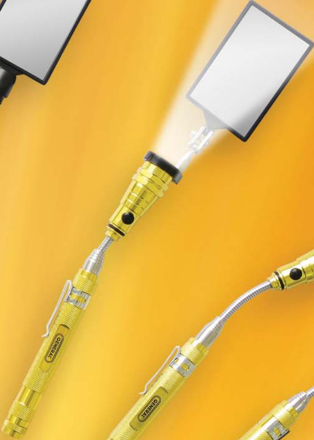
91560 Telescoping Lighted Rectangular Inspection Mirror