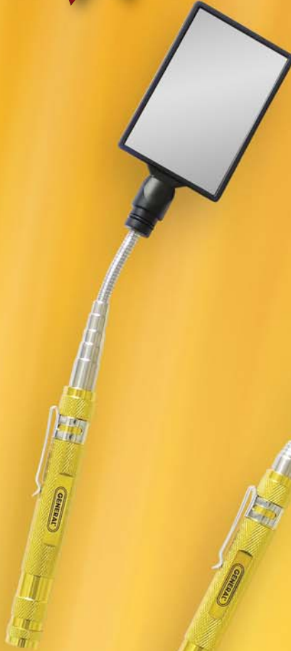
90560 Telescoping Rectangular Inspection Mirror