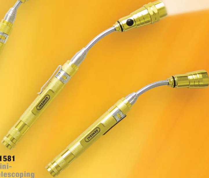
91581 Mini- Telescoping Lighted Magnetic Pick-Up