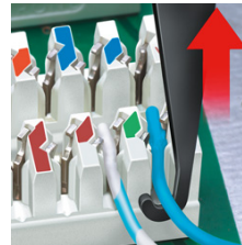
With integrated pulling hook