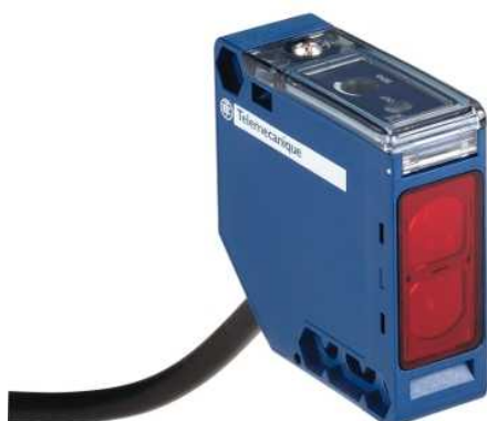
photo-electric sensor - XUK - polarised - Sn 5m - 12..24VDC - cable 2m