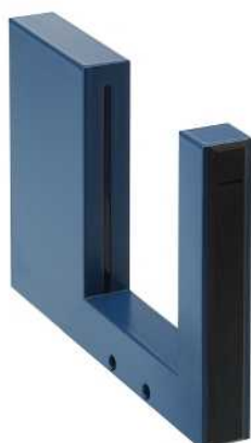
photo-electric sensor - XUV - frame - 60X60mm - 12..24VDC - M8