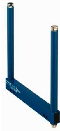
photo-electric sensor - XUV - fork - 120X120mm - 12..24VDC - M8