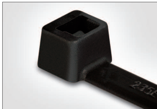
Commercial Grade Cable Ties.

For more information on tooling please refer to the Application Tooling chapter in the Product Catalogue