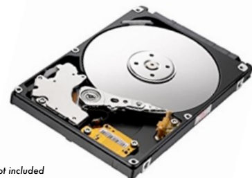
Storage not included