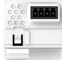
RS485 interface - White