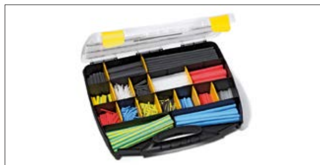
ShrinkKit 321 Universal.