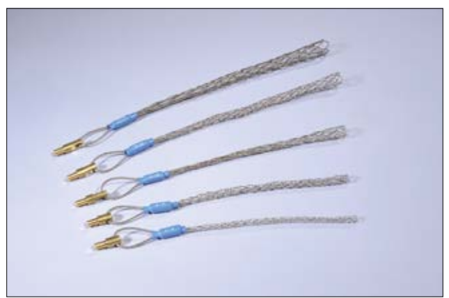
Cable Grips are available in five different sizes to attach a wide range of cable