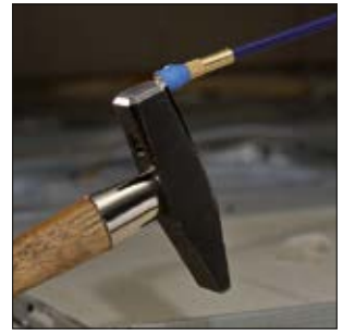
The strong magnet lifts a metallic tool of up to 2.5 kg.