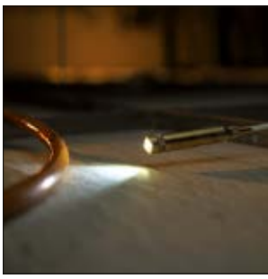
The Cable Scout+ Beam - a perfect tool for seeing into cavities.