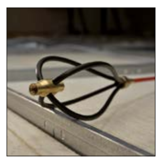
The whisk allows the rod to glide over obstructions easily.