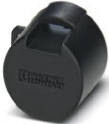
Protective cap for 3 and 5-pos. PRC device plugs

Please be informed that the data shown in this PDF Document is generated from our Online Catalog. Please find the complete data in the user's documentation. Our General Terms of Use for Downloads are valid ( http://phoenixcontact.com/download )