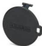
Protective cap for 3 and 5-pos. PRC field plugs