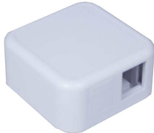
1 way WAP junction box external single outlet