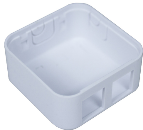
WAP junction box cover internal