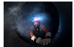
Flammable and/or explosive atmospheres

A world leader in digital thermometers, Rototherm has become the standard for accurate and reliable measurement across the following industries: