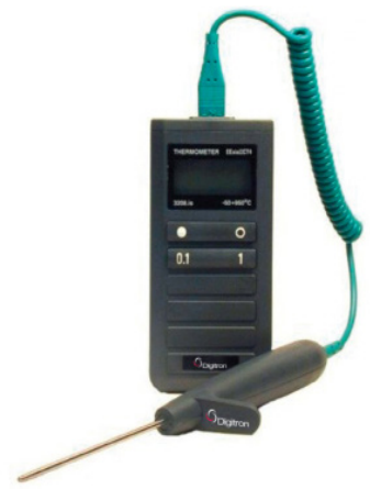
3208 IS Model

For other options, please contact us digitronsales@rototherm.co.uk or +44 (0)1656 740551