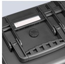
With pressure valve for venting and name plate