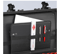
With document compartment