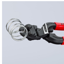
Powerful through to the tips