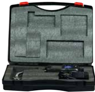
FG-3000R with Accessories in Included Carrying Case