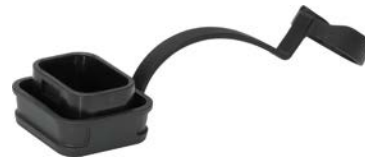
Protection cover black for IP67 / IP69K for 4762