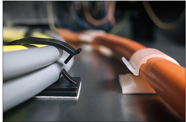
Self-adhesive one piece fixing clips RB20 (l) and RB14 (r).