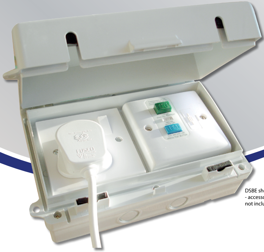
DSBE shown - accessories not included