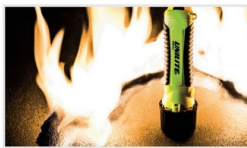
ZONE 0 ATEX COMPLIANT