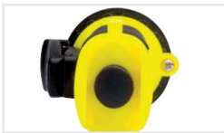
ELECTRONIC TACTICAL SWITCH