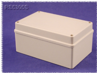
Assembled View (Top)