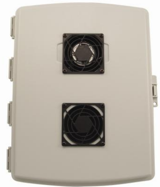
Vented Lid & Fan