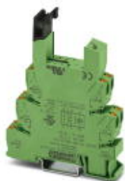
14 mm PLC basic terminal block without relay, for mounting on DIN rail NS 35/7,5, Push-in connection, 2 PDT, Input voltage 24 V DC

Please be informed that the data shown in this PDF Document is generated from our Online Catalog. Please find the complete data in the user's documentation. Our General Terms of Use for Downloads are valid ( http://phoenixcontact.com/download )