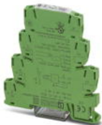
Timer relay with off delay (with control contact) and an adjustable time range (3 s - 300 s), with screw connection

Please be informed that the data shown in this PDF Document is generated from our Online Catalog. Please find the complete data in the user's documentation. Our General Terms of Use for Downloads are valid ( http://phoenixcontact.com/download )