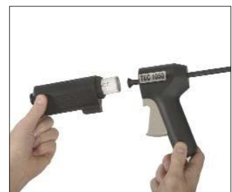
Quick and easy glue cartridge re-load