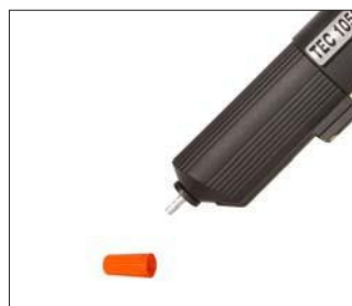
Ball check valve incorporated in each glue cartridge plus nozzle cap eliminates waste