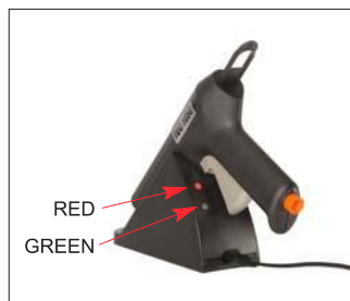
Base heating station with red 'on' light and green 'ready' indicator