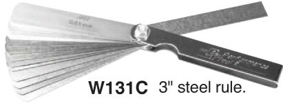
W131C 3" steel rule.