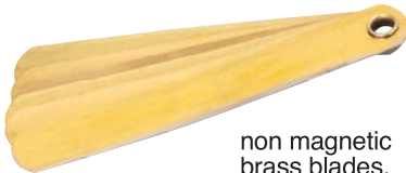
non magnetic brass blades.