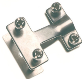
Cable clamp for miniature connectors