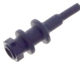
Rubber grommet for miniature connectors