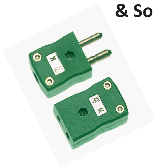
'Thermocouple plug and socket supplied as a pair'