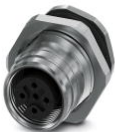
Flush-type connector, 5-position, Socket, straight, M12-Push-Pull, A-coded, Rear mounting, M16, Wave soldering contacts

Please be informed that the data shown in this PDF Document is generated from our Online Catalog. Please find the complete data in the user's documentation. Our General Terms of Use for Downloads are valid ( http://phoenixcontact.com/download )