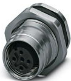
Flush-type connector, 4-position, Socket, straight, M12-Push-Pull, D-coded, Rear mounting, M16, Wave soldering contacts

Please be informed that the data shown in this PDF Document is generated from our Online Catalog. Please find the complete data in the user's documentation. Our General Terms of Use for Downloads are valid ( http://phoenixcontact.com/download )