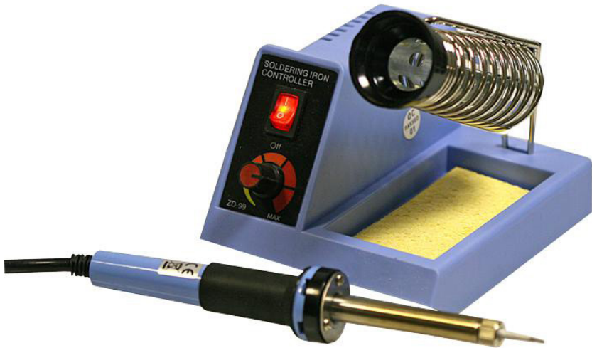
Model: D01843 48W Soldering Station