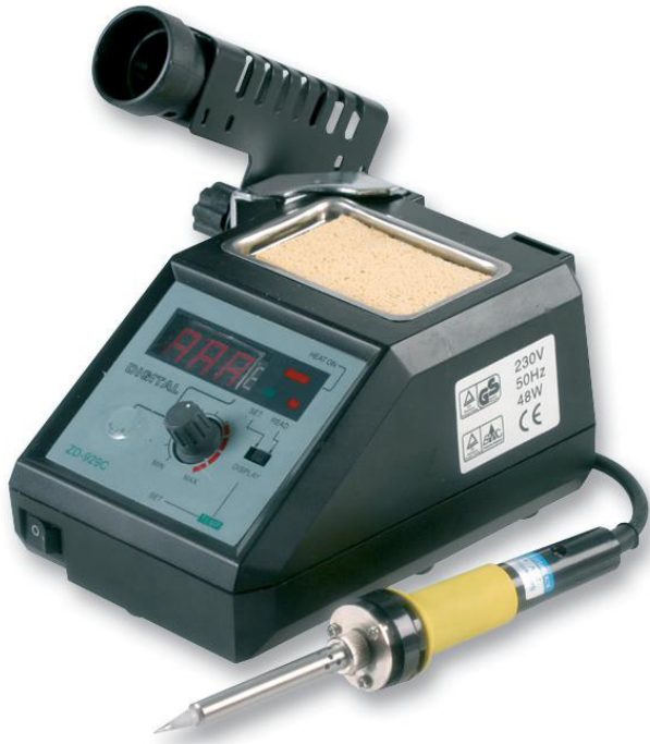
Model: ZD-929C 48W Digital Soldering Station