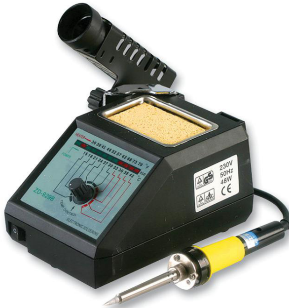
Model: ZD-929B 48W ESD Safe Soldering Station