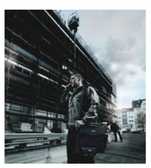
Wera 2go Tool Container with inner and outer hook and loop fastener system<br/>br /> Individually configurable for greater mobility<br/>br /> Ideal also for the docking of Wera textile boxes and pouches equipped with hook and loop fastener zones<br/>br /> Easy insertion and removal<br/>br /> Hands remain free during transport<br/>br />