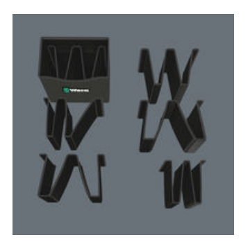
The variably adjustable hook and loop fastener partition in the Tool Quiver ensures neat and tidy arrangement of the tools.