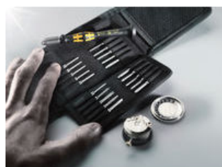
Kraftform Micro ESD bit holder