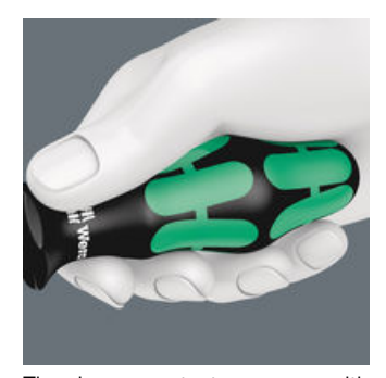
The large contact area – with particularly high friction to the soft zones – results in high torque transfer without any bruising from the edges.