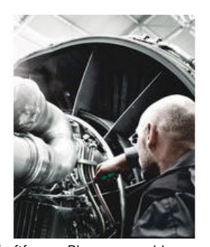
Kraftform Plus screwdrivers – ergonomics you can grasp. They relieve the entire hand-arm system even when used intensively. Along with other technical and product advantages such as the Lasertip for a secure fit in the screw head, Kraftform screwdrivers are the ideal choice whenever manual screwdriving jobs are concerned.