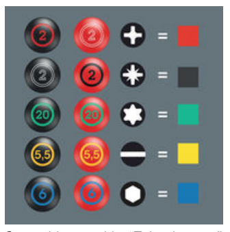
Screwdrivers with "Take it easy" tool finder: colour coding according to profile and size stamp.