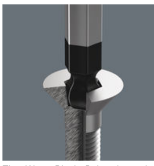
The Wera Black Point tip and a refined hardening process ensure long service life of the tip, improved corrosion protection and an exact fit.