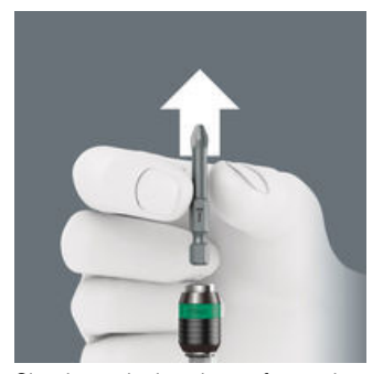
Simply push the sleeve forward to change the bit. The spring mechanism lifts the bit off the magnet and unlocks the tool. The bit can be easily removed. The rapid-out function makes it easy to remove even the smallest bits without extra tools.