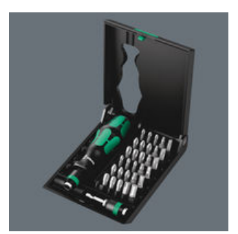
The tools can be stored and carried either in a solid plastic case or a robust pouch. In this way the tool is always to hand.