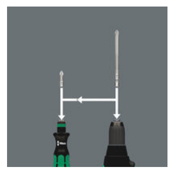
The sets come with a Kraftform handle, quick-release chuck and bits for manual and power tool operations.