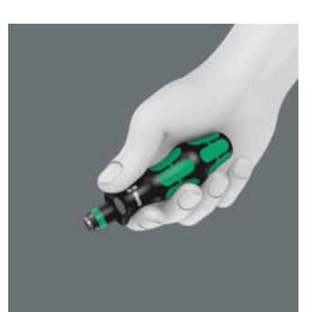
The outstanding design of the Kraftform handle that fits perfectly into the hand prevents hand injuries such as blisters and calluses.