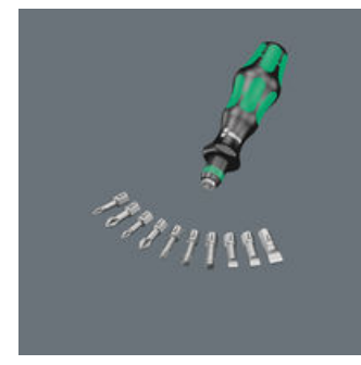
The handle/interchangeable blade system allows rapid exchange of the blades required for a wide range of applications.