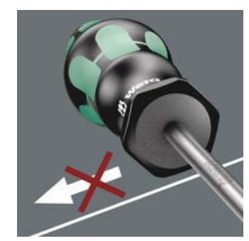
The hexagonal non-roll feature prevents any rolling away at the workplace.